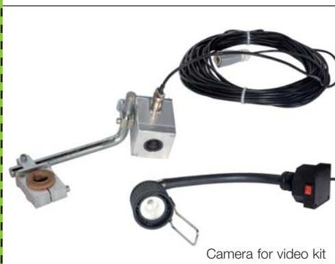
Camera for video kit