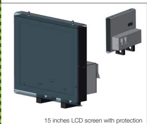
15 inches LCD screen with protection